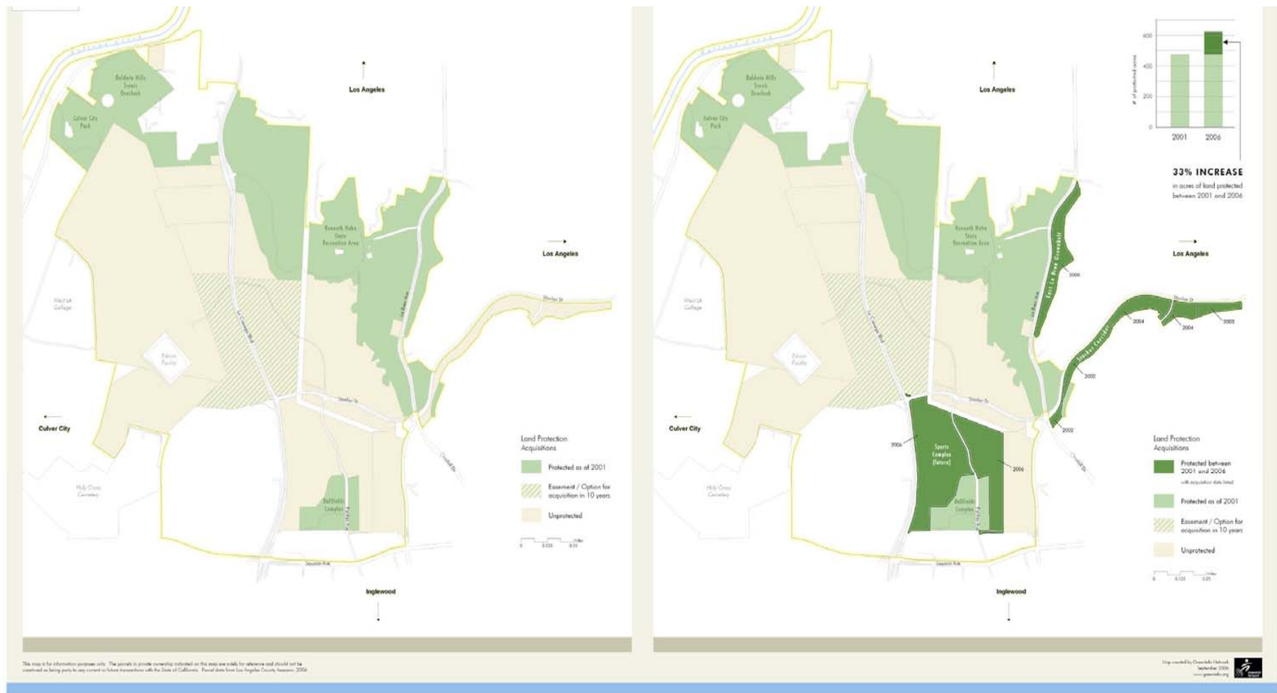
Figure – 2