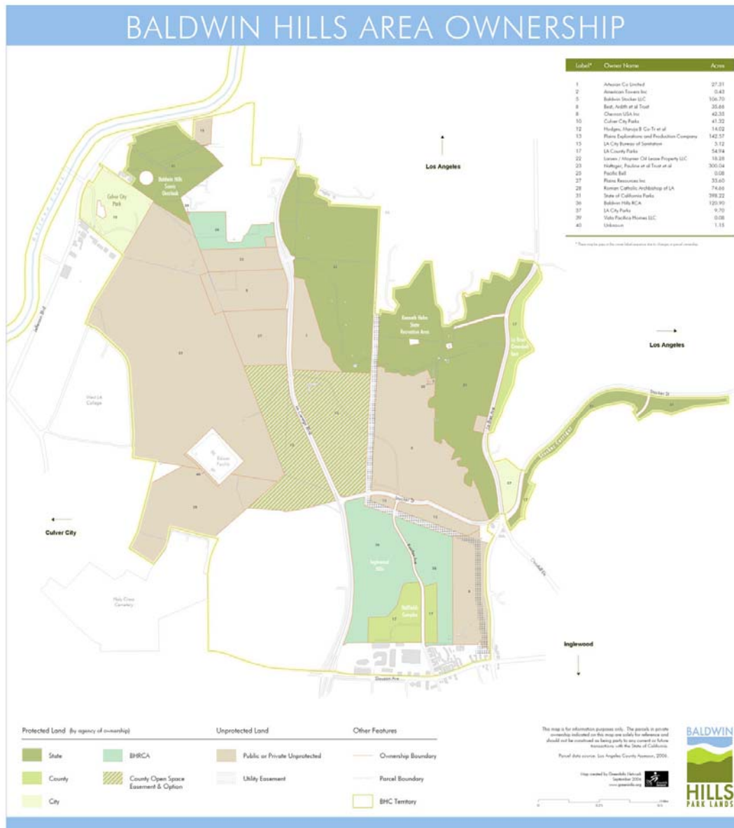
Figure – 1