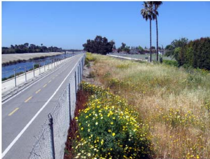
Milton Street Park Site (Ballona Creek on left)