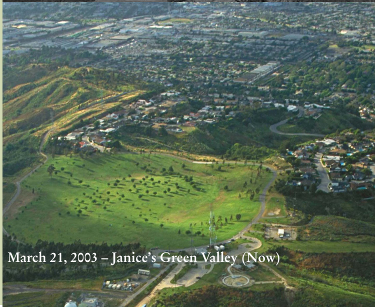
March 21, 2003 – Janice's Green Valley (Now)